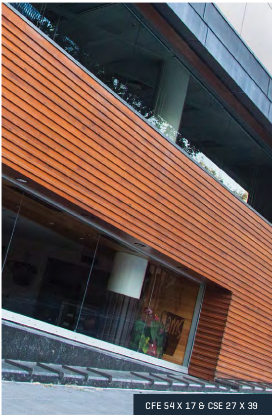
CFE 54 X 17 & CSE 27 X 39